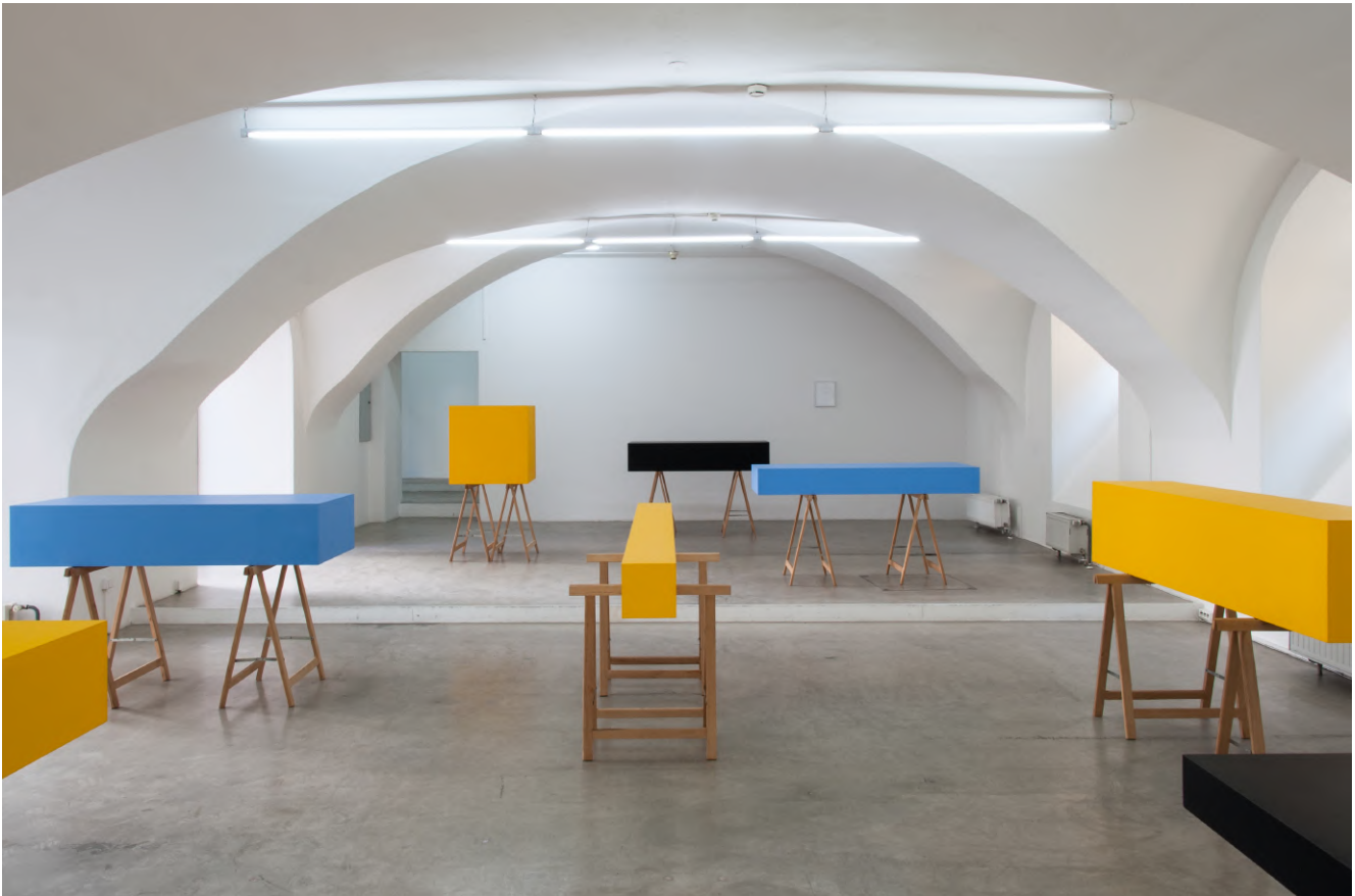
Installation view of 'Instability of Fundamentals' at Grazer Kunstverein, Graz, 2016.