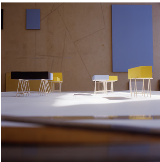
Model of 'Instability of Fundamentals', studio view, Brussels, 1990.

2- Peter Sloterdijk: 'Du mußt dein Leben ändern' 2009 (translated from German)