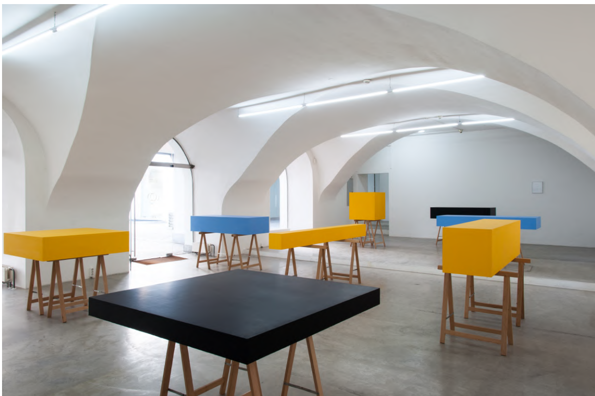
Installation view of 'Instability of Fundamentals' at Grazer Kunstverein, Graz, 2016.