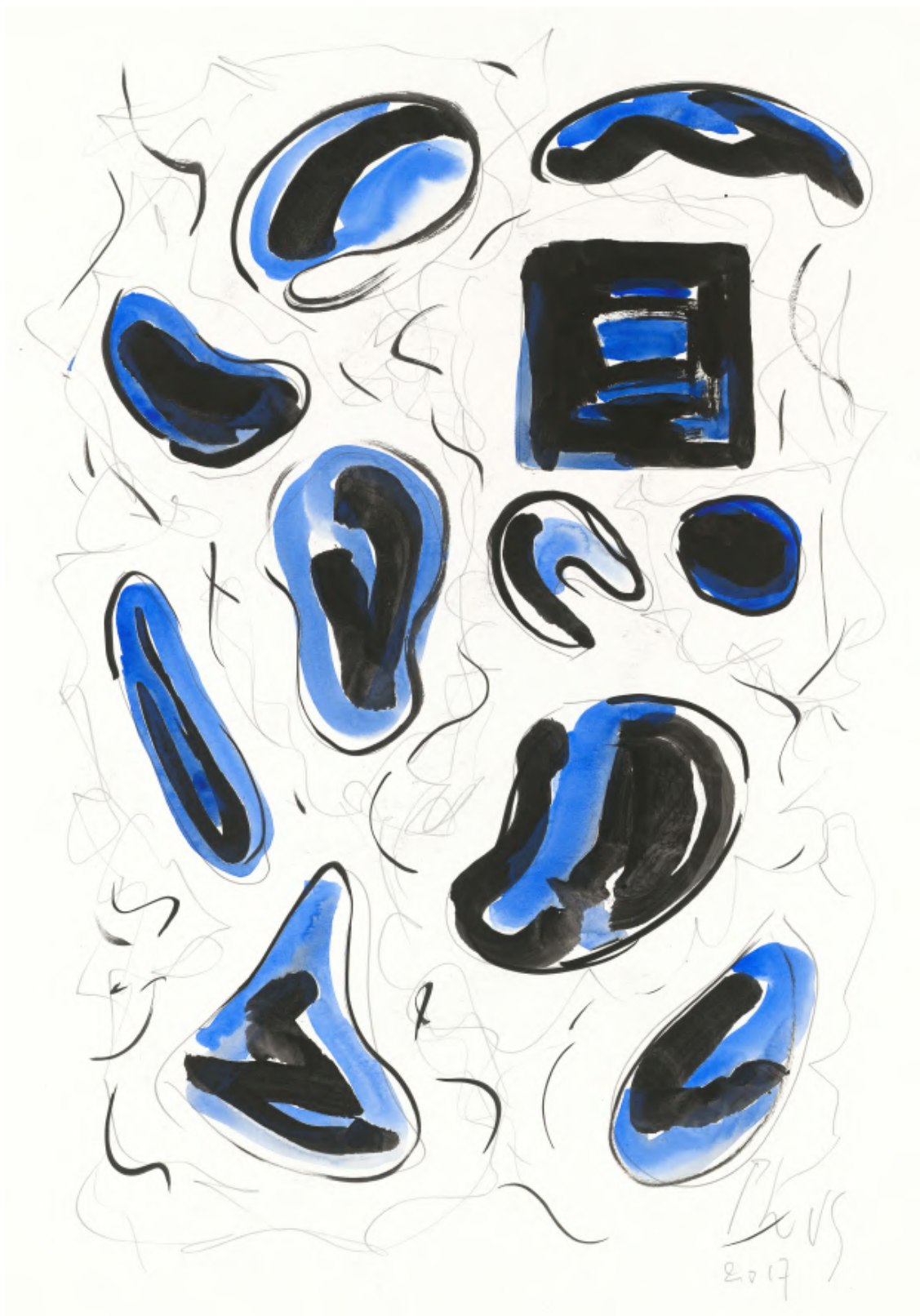
[no title], 2017 acrylic, watercolor and graphite on paper